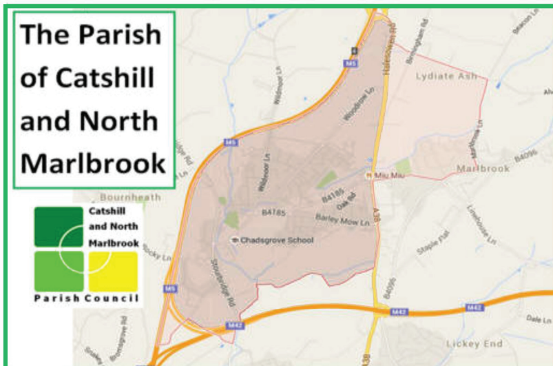
Area covered by Neighbourhood Plan