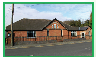
Catshill Village Hall